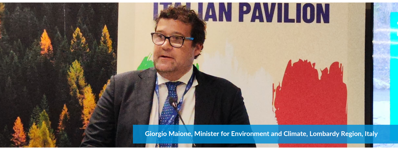
Giorgio Maione, Minister for Environment and Climate, Lombardy Region, Italy

He reiterated the European Parliament's calls for global financial contributions, biodiversity protection, renewable energy targets, and the end of fossil fuel subsidies. The Minister emphasized the need to bring climate change policies to the local level to achieve the goals of the Paris Agreement.