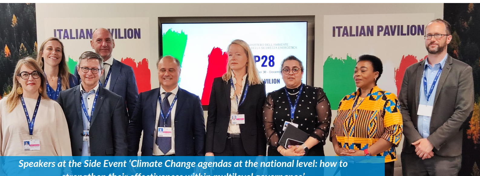
Speakers at the Side Event 'Climate Change agendas at the national level: how to strengthen their effectiveness within multilevel governance'

The side event provided a platform for fruitful discussions and showcased innovative approaches from regions around the world, reinforcing the idea that effective multilevel governance is essential for accelerated action on climate change. As COP28 continues, the insights shared at this side event are expected to contribute significantly to global efforts in achieving sustainable and resilient futures.