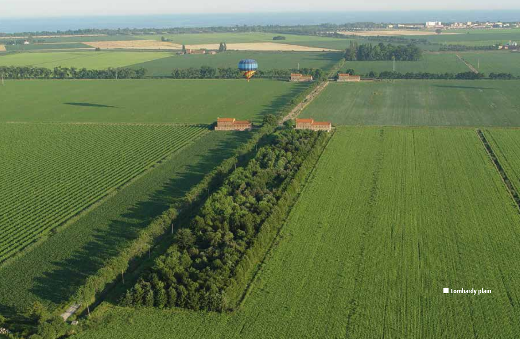
■ Lombardy plain