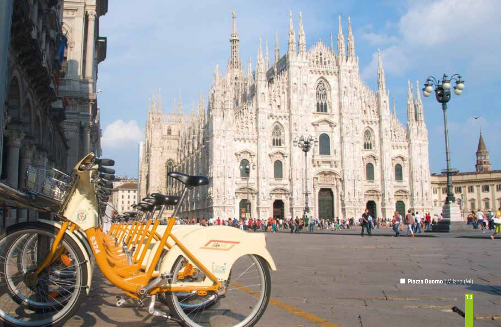
■ Piazza Duomo | Milano (MI)